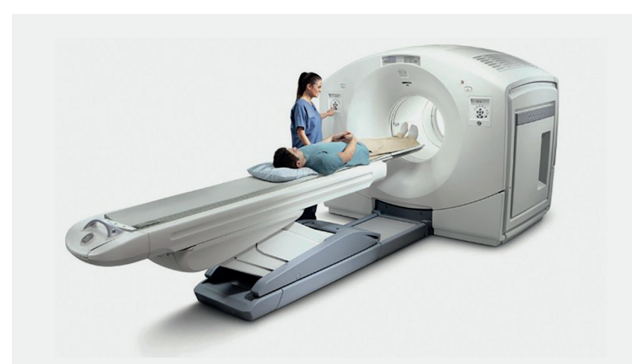
Building 21 Kungälv's Hospital