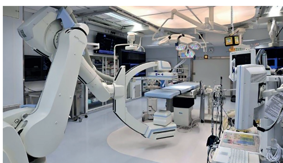
Imaging and Treatment Centre, Sahlgrenska University Hospital