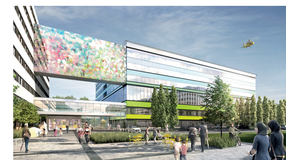
Extension of Drottning Silvias Barn-Och Ungdomssjukhus (Queen Silvia's Paediatric Hospital), Sahlgrenska University Hospital