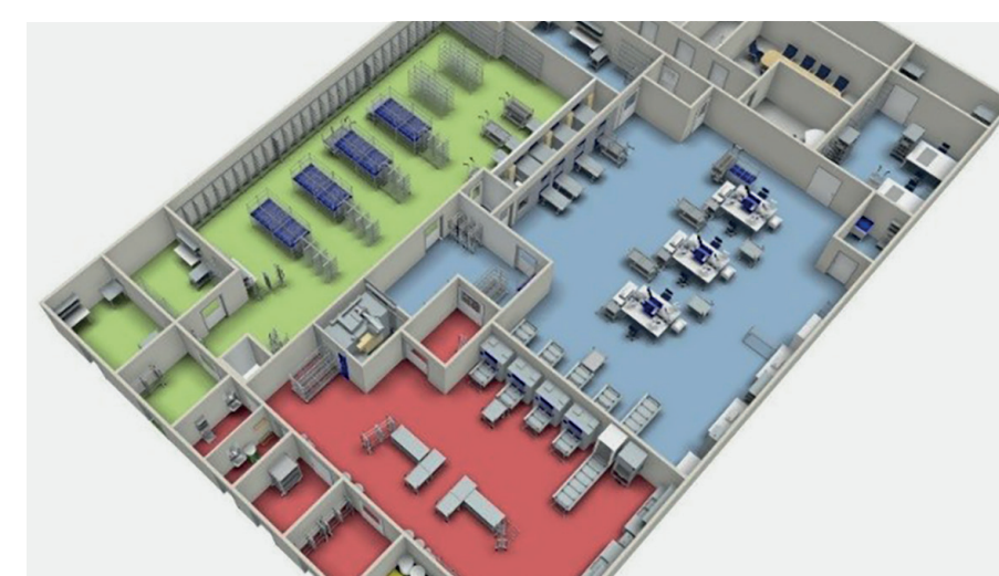
Sterile Units in BOIC and Queen Silvia's Paediatric Hospital